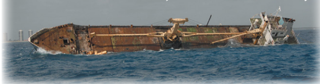
Rybovich Endowment Reef