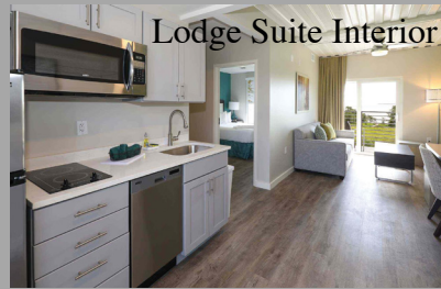
Lodge Suite Interior