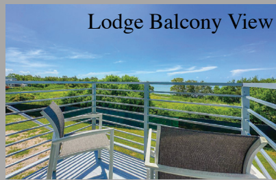
Lodge Balcony View