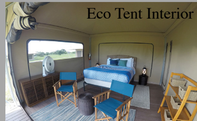
Eco Tent Interior