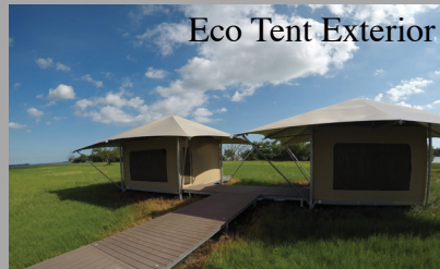
Eco Tent Exterior