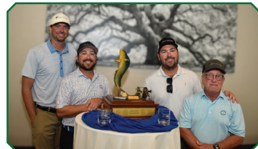
2024 Tyska Trophy winners, 'Team Goin' Raptor