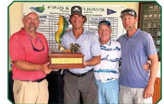
2023 Tyska Trophy winners, 'Team Champions Club'