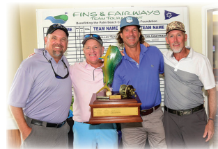
2021 Tyska Trophy winners, 'Team Salty'