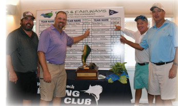
2019 tournament Tyska Trophy winners, 'Team Salty'